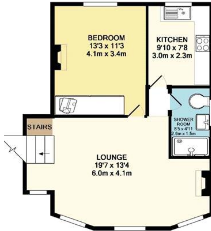
1ST FLOOR APPROX. FLOOR AREA 515 SQ.FT. (47.8 SQ.M.)