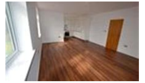
Stunning 2 bedroom 2 bathroom flat in Purley's Newest Development. An exceptional two bedroom apartment with spacious bedroom areas, stylish bathrooms, open plan kitchen/living with modern appliances ,communal garden and gated parking. Located a short walk from Purley station & all its amenities.