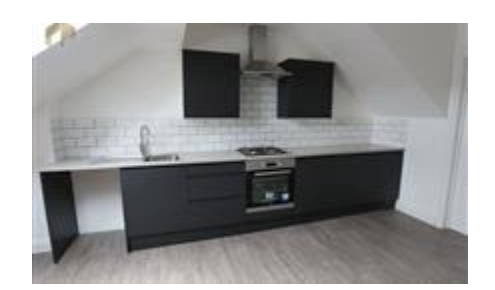
Brighton road Purley £1,300 pcm