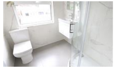
Stunning 2 bedroom flat in Purley's Newest Development. An exceptional two bedroom apartment with spacious bedroom areas, stylish bathroom, open plan kitchen/living with modern appliances and a large communal garden. Located a short walk from Purley station & all its amenities. Available now